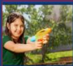
WATER PISTOLS OR ARTS & CRAFTS ?