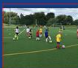
FOOTBALL OR ARCHERY ?