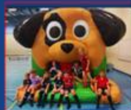
INFLATABLES OR DODGEBALL ?