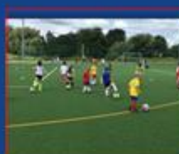
FOOTBALL OR ARCHERY ?