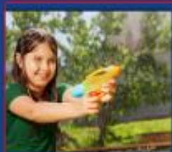
WATER PISTOLS OR ARTS & CRAFTS ?