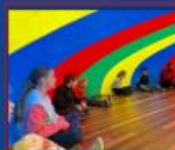
PARACHUTE OR SWIMMING ?