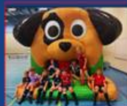
INFLATABLES OR DODGEBALL ?