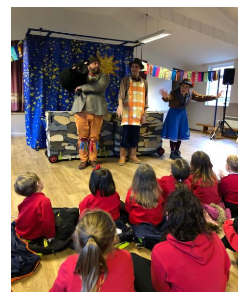
Thank you to the PTA for funding this very special treat!