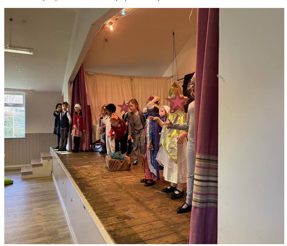
Hope Community Perseverance Compassion

The joy that it delivered at every performance to the children who took part and to those that came and watched, was a privilege to witness. Congratulations to everyone involved and thank you. It reminded us about the real reason we celebrate Christmas and that we should and must keep this in mind at all times as we prepare for that very special day on 25<sup>th</sup> December.