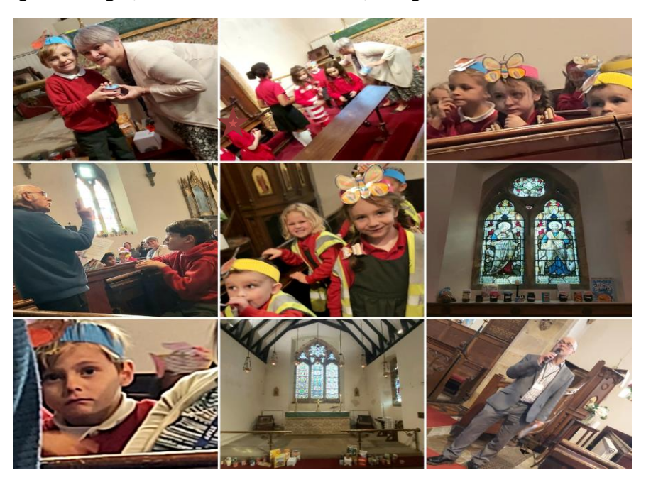
Hope Community Perseverance Compassion

We enjoyed presenting our Harvest Service to you all on Thursday afternoon. I would like to take this opportunity to thank you for your generosity in sending so many gifts. These will go to the homeless charities in York as usual. Items suitable for breakfasts such as cereals, porridge, fruit juice, tea, coffee and fruit will go to Carecent who serve breakfast to the homeless. Other items such as tins or vegetables will go to Arclight , a shelter for the homeless, along with donations of warm clothes.