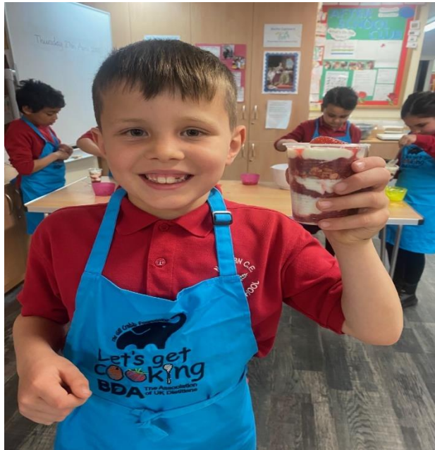
Lovely photo from the previous week's cooking club