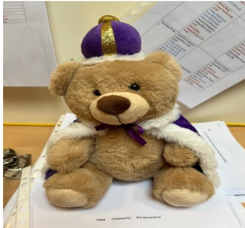
The Royal Bear

Finally, before the children go home, they will entertain the guests from the village with our rendition of the Coronation Song and we will also stand together for the National Anthem. I can't wait to tell you how it all went!