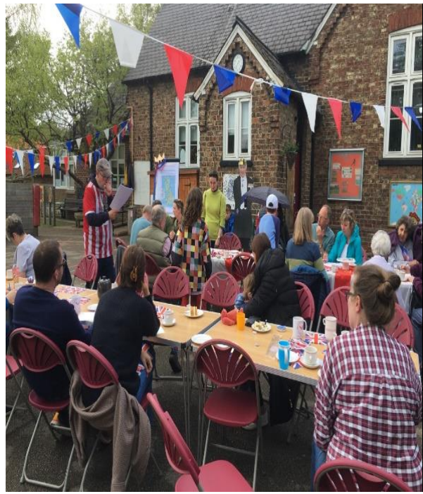
The Royal Quiz