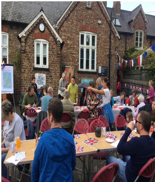
Making sure everyone is served

The next 'Friends of Naburn CE Primary School' meeting is scheduled to take place on Wednesday 24 th May at 6pm . Anyone and everyone is welcome, so please do come along. Thank you