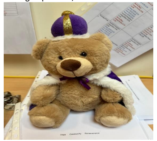
The Royal Bear

I hope as many of you can come along as possible, it'll be a fantastic afternoon.