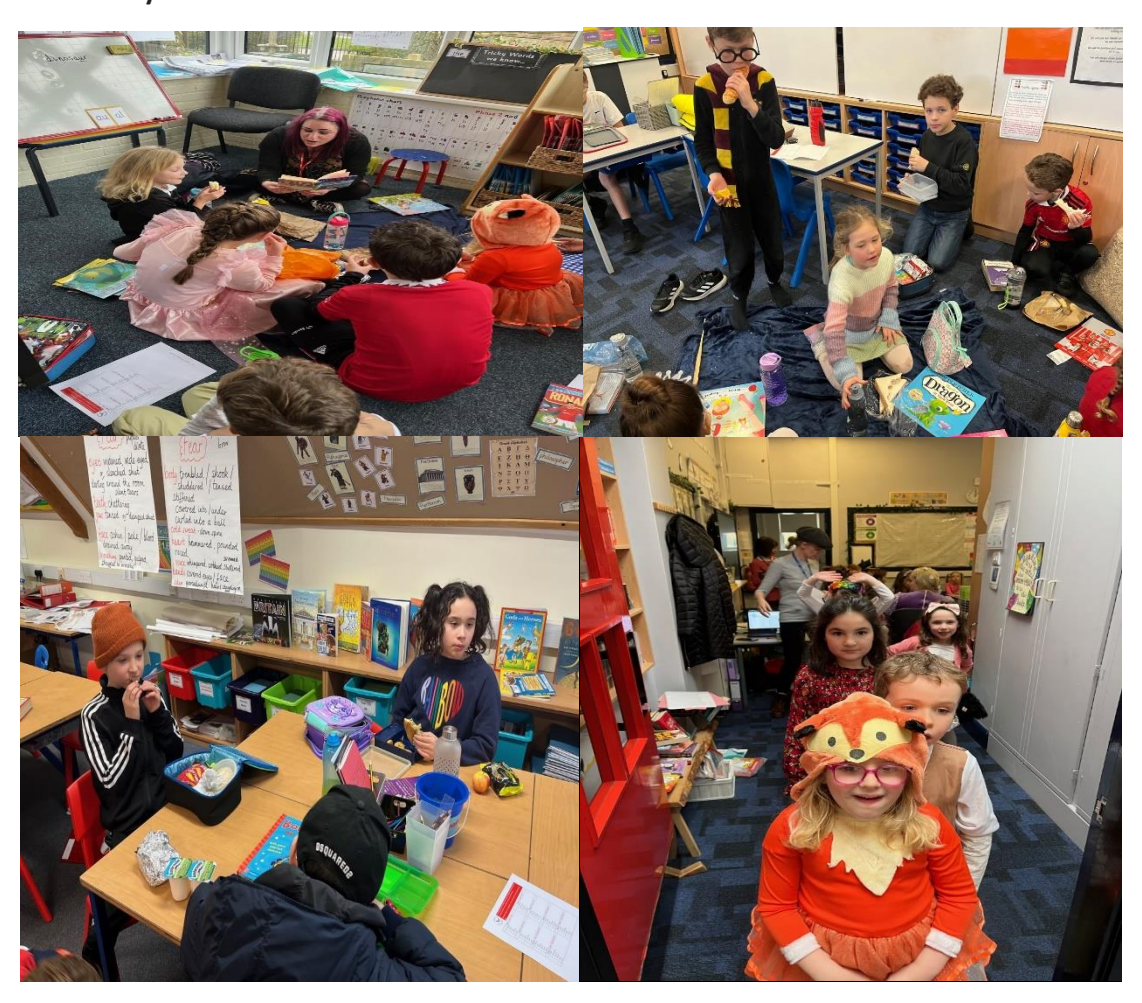
Hope Community Perseverance Compassion

'Our Christian Vision is to build an environment of support and growth rooted in core values of perseverance, hope and community.'