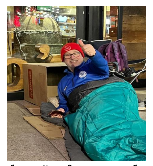
Hope Community Perseverance Compassion

I would like to start by thanking you all for sponsoring me and our team. It was a great experience for an extremely worthwhile cause. I chose to sleep out last Thursday night. Many are not in that privileged position to have that choice. <a href="https://join.landaid.org/fundraisers/YorkieSleepers">https://join.landaid.org/fundraisers/YorkieSleepers</a>