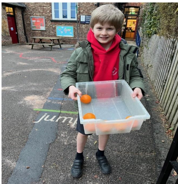
Orange Collecting for the Christingle Service

It would be lovely to welcome all who can attend the service, so please do come along if you can.