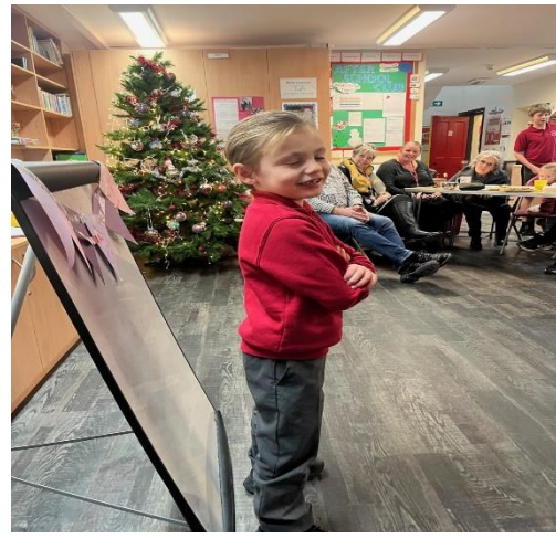
Elvis is still in the building!