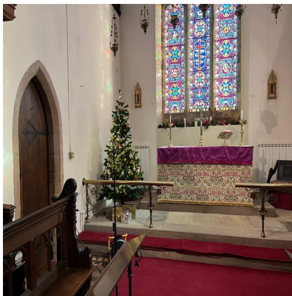
Church is ready for the service