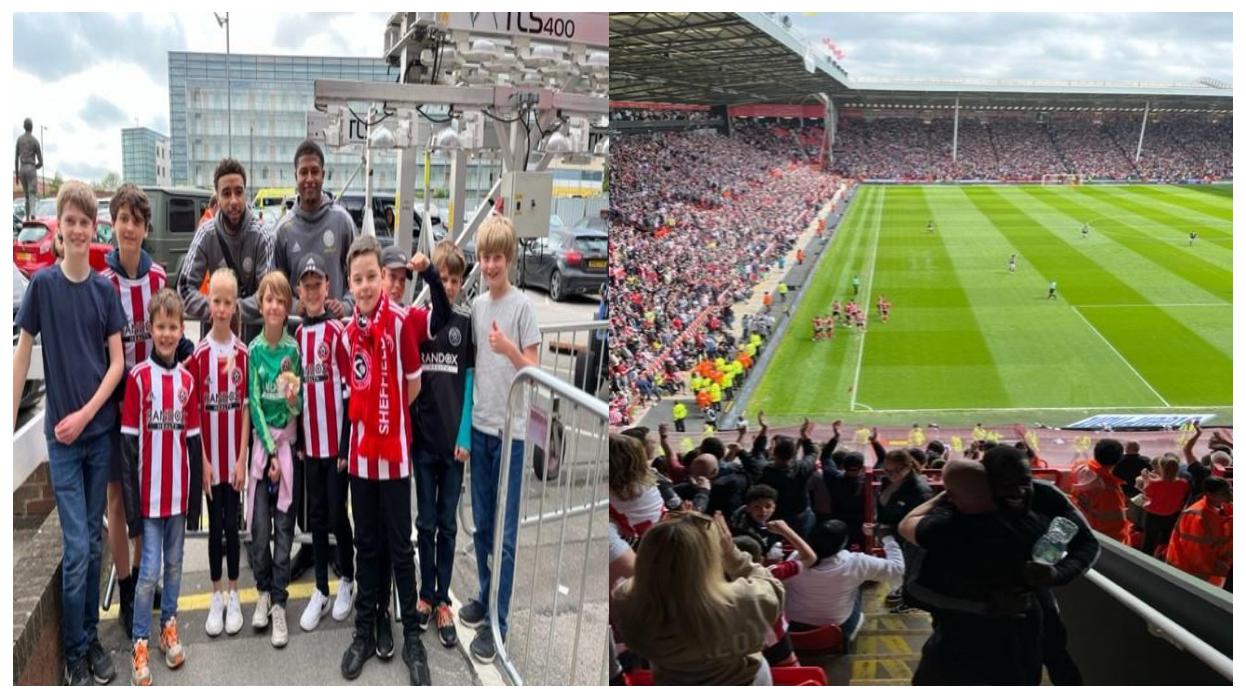
Hope Community Perseverance

'Our Christian Vision is to build an environment of support and growth rooted in core values of perseverance, hope and community.'