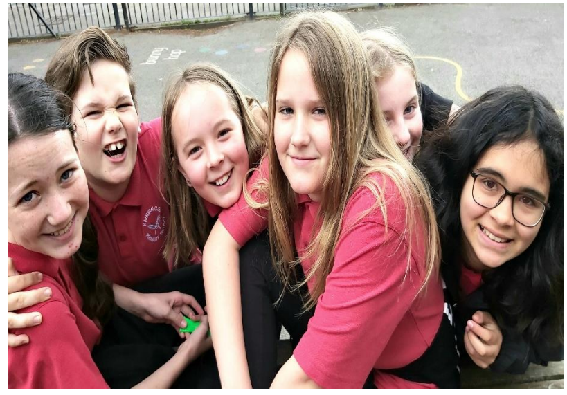
Lovely photo of the Y6 children after their final test.