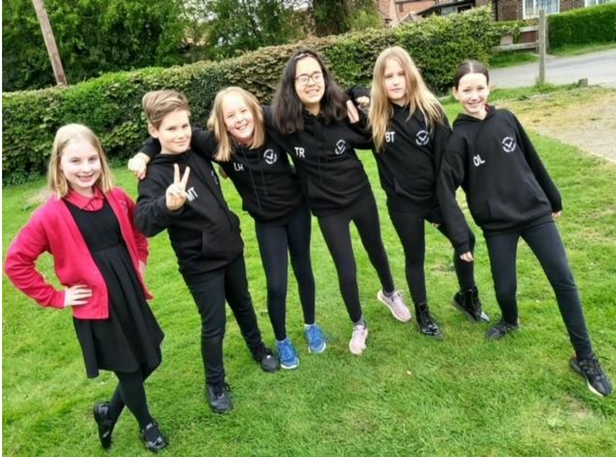
Our lovely Year 6 children waiting for their photographs to be taken.

You will be receiving class photographs in a couple of weeks. I can confidently say that the photos that I saw on the day looked sensational and I am looking forward to seeing the proofs when they arrive!