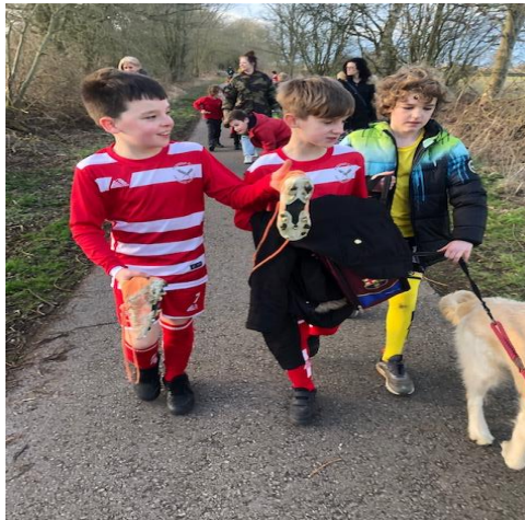
Walking back after the game from Millbridge Stadium

We took two teams to Millbridge Farm to play football against AYJS. The matches were played enthusiastically and in very good spirit. Spectators appreciated the level of skill and determination from both teams. Thank you to AYJS for playing and thank you to the Durant family for letting us use their facilities for the game and also marking the pitch out and providing seats for parents and friends of the school. It resembled a proper football stadium. Thank you also to all the parents who helped walk the children to and from the venue.