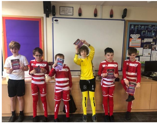
TTRockstar winners from last week