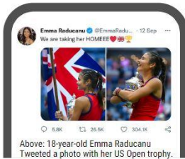
Above: 18-year-old Emma Raducanu Tweeted a photo with her US Open trophy.